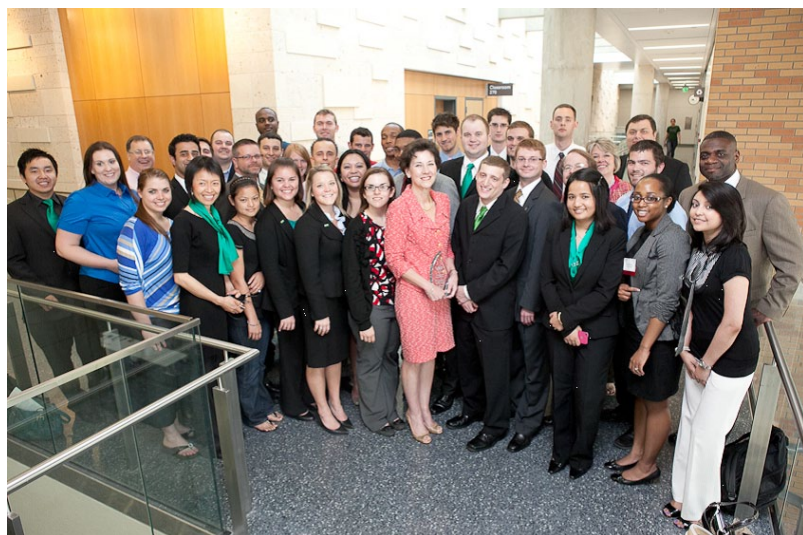
Commissioner Kitzman with RMI Faculty, Students, and Alums

Commissioner Kitzman's remarks included a wide range of current topics related to the Texas insurance market. More than 120 risk management and insurance industry representatives and UNT students and faculty attended the event.