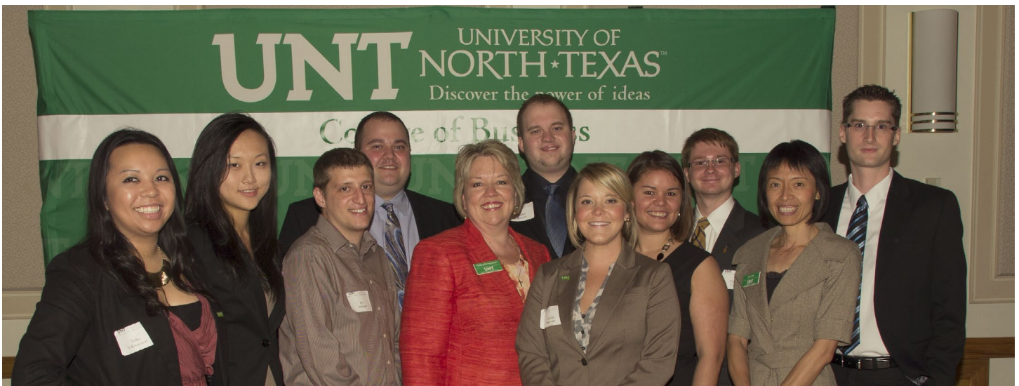
Some of the RMI Scholarship Recipients and RMI Faculty