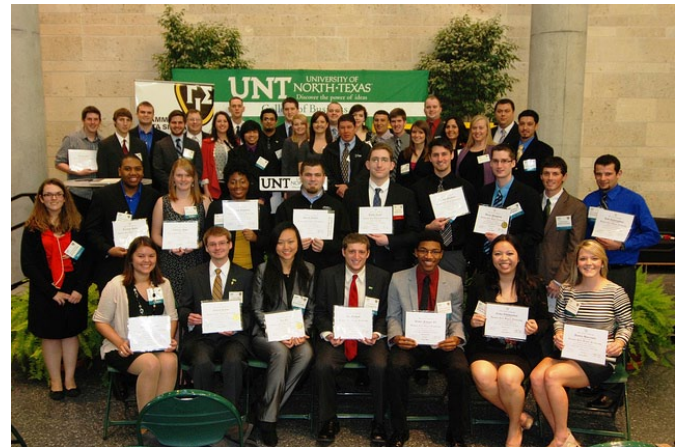
Members of the Beta Zeta Chapter of Gamma Iota Sigma

The University of North Texas Risk Management and Insurance Program became home to the largest Gamma Iota Sigma chapter in Texas when the Beta Zeta Chapter was chartered and 67 members were inducted Saturday, February 18, 2012. Gamma Iota Sigma is the International Risk Management, Insurance, and Actuarial Science Collegiate Fraternity. The chartering and conferment were the culmination of years of work by students and faculty and a rigorous review of the application by the national organization. The UNT chapter is the 54th chapter of Gamma Iota Sigma and was built upon the formerly successful run Risk Management and Insurance Club at UNT.